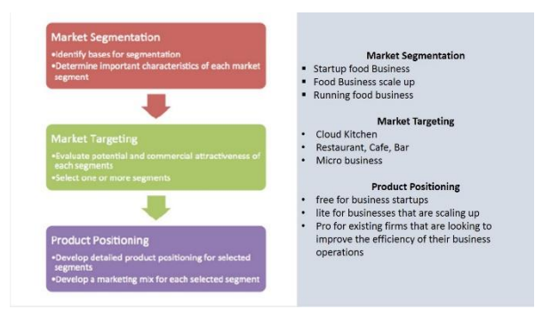
Figure 3. STP rumahmakan.online

Based on these opportunities, Segmenting, Positioning, and Targeting analysis is carried out for the basis of the marketing strategy to be made and as one of the considerations for determining the subscription price range.