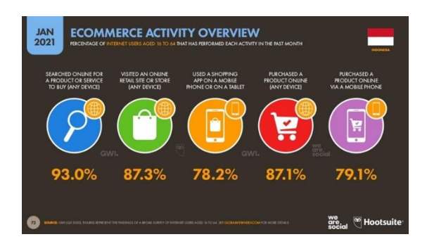
Figure 2. Ecommerce Activity overview

increase of approximately 78000 merchants joining the GoFood service. On the other GrabFood reaches hand. Eighty-three trillion rupias while GoFood reaches Rp. 28 trillion. This record is also supported by the databox of the Demographic Institute of the Faculty of Economics and Business, the University of Indonesia, which states that it spent 97 percent on food orders, 76 percent on delivery services, and 75 percent on the COVID-19 transportation during epidemic. From the data above, it can be seen that during the COVID-19 pandemic, there was an increase in users/purchases of food online.